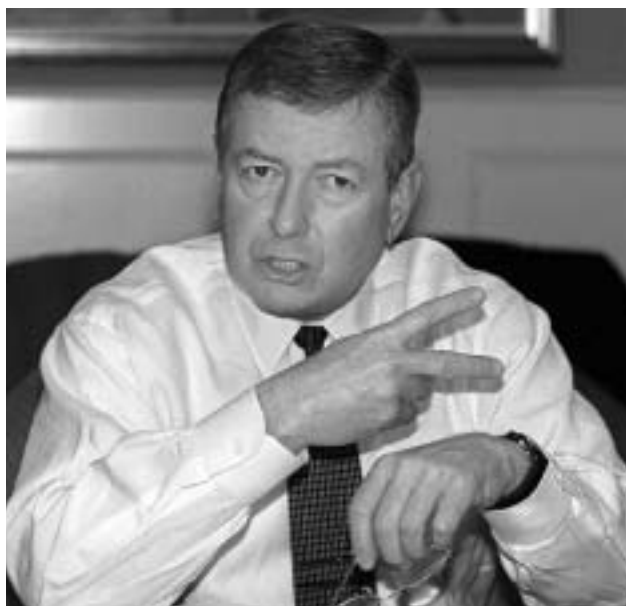
Attorney General John Ashcroft.

In fact, the Attorney General himself has acknowledged that the FBI could use the law even more broadly. The following exchange between the Attorney General and Rep. Tammy Baldwin (D-WI) took place before the House Judiciary Committee in June 2003: